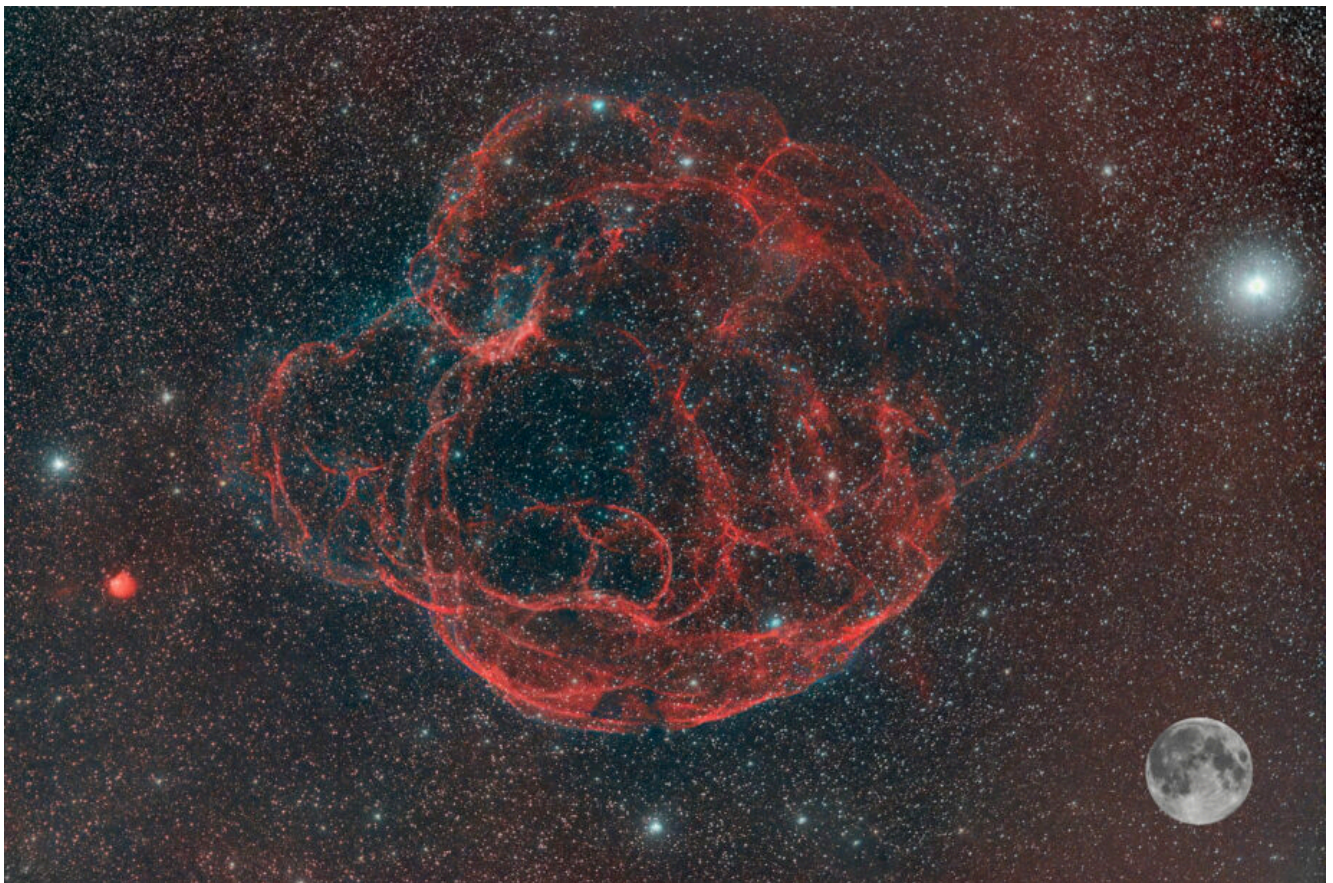
Simeis 147 – dimensioni a confronto con la Luna Piena