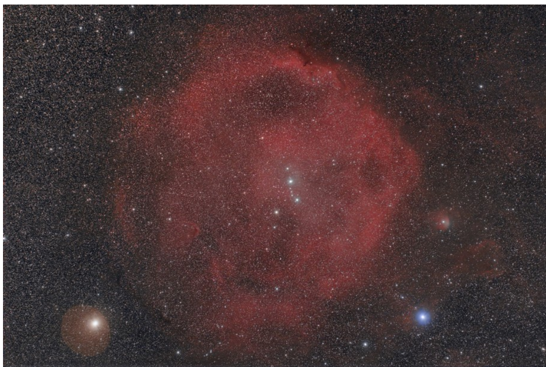
Sh2-264 - 29/11/2016