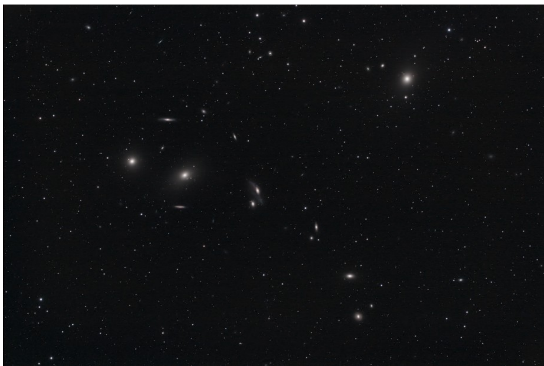
Catena di Markarian - 03/01/2017