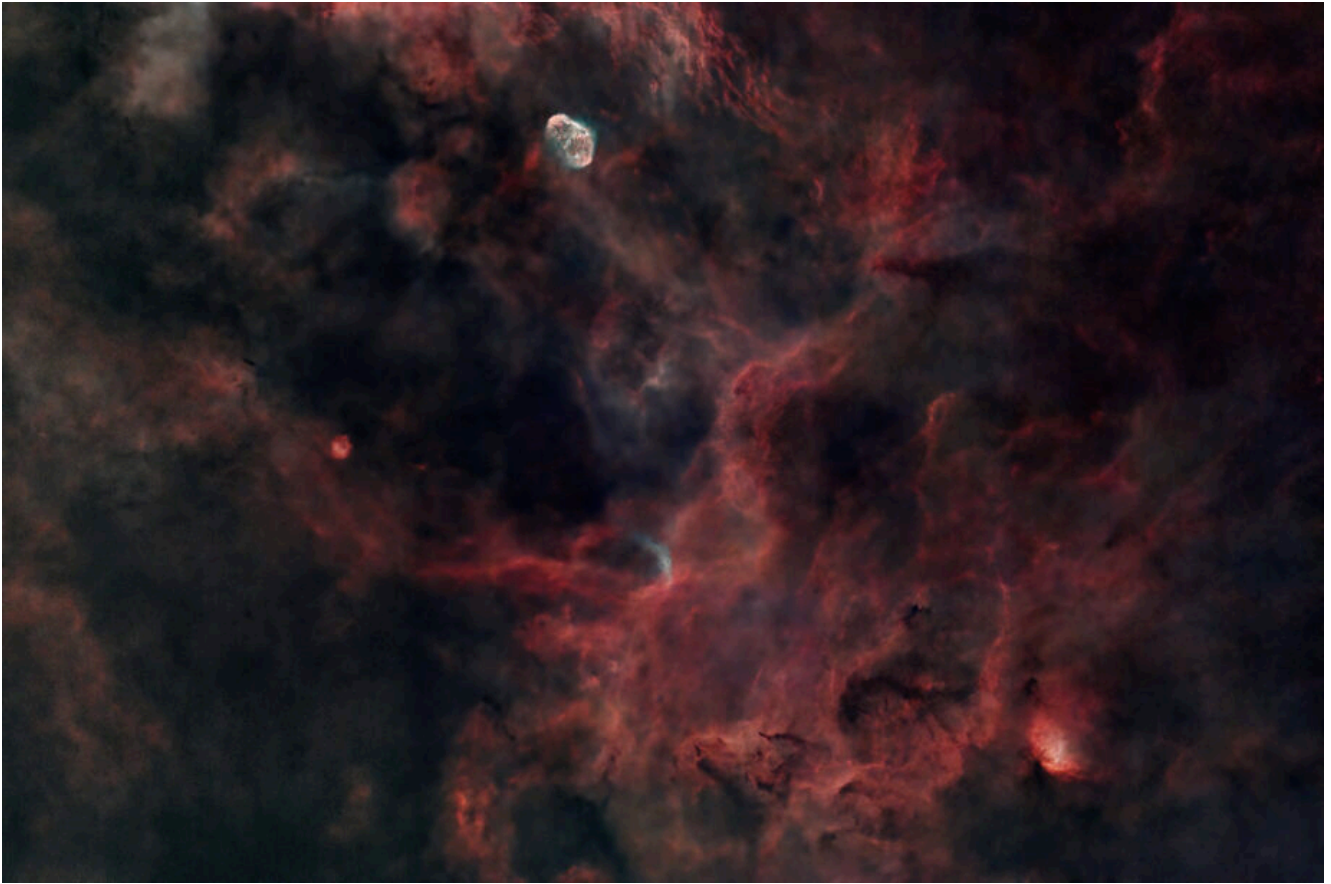
WR 134, starless – 12/11/2023