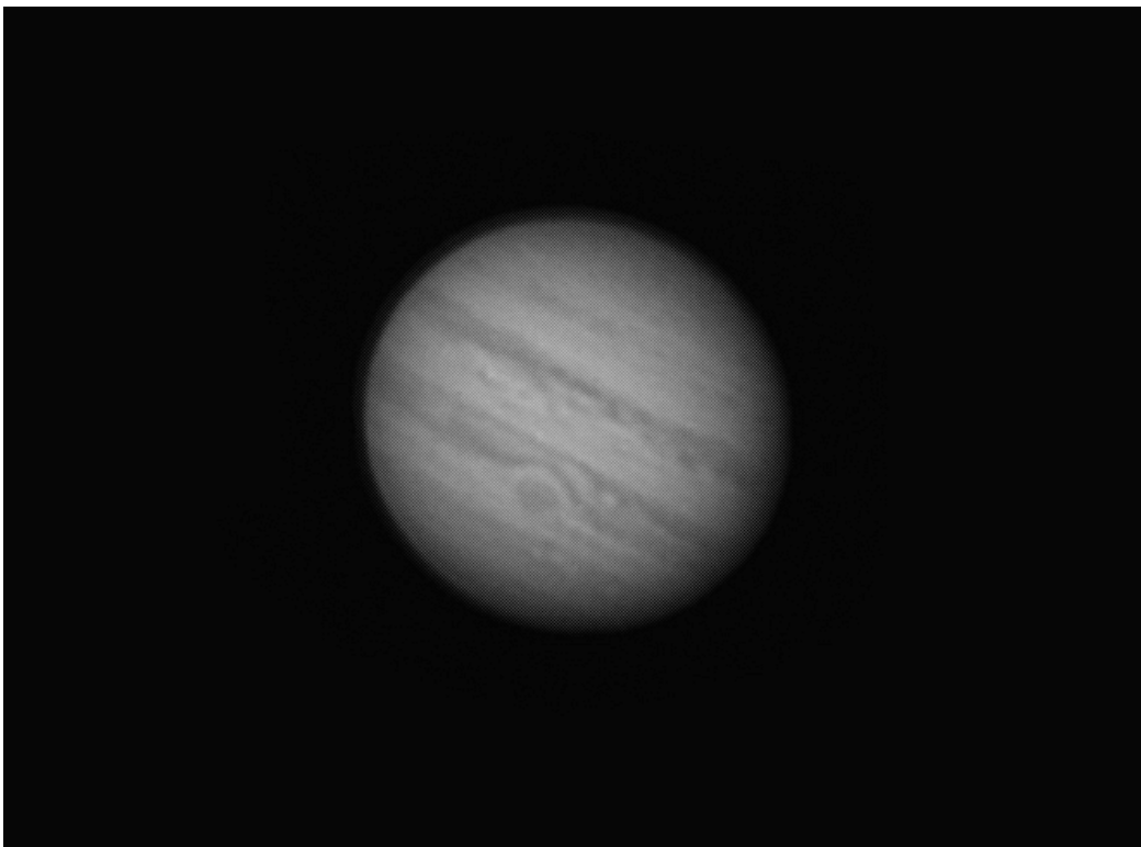
Giove - 13/03/2014 (Magzero MZ-5m)