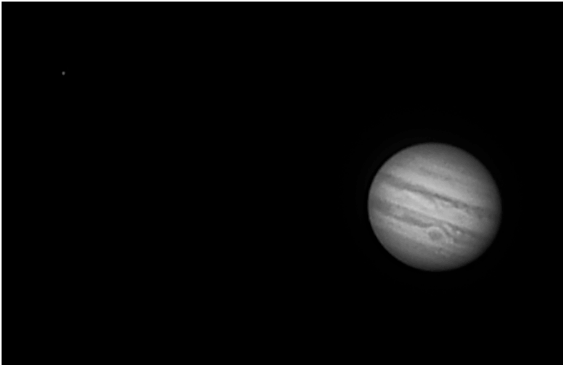
Giove e Ganimede - 13/03/2014 (Atik 314L+)