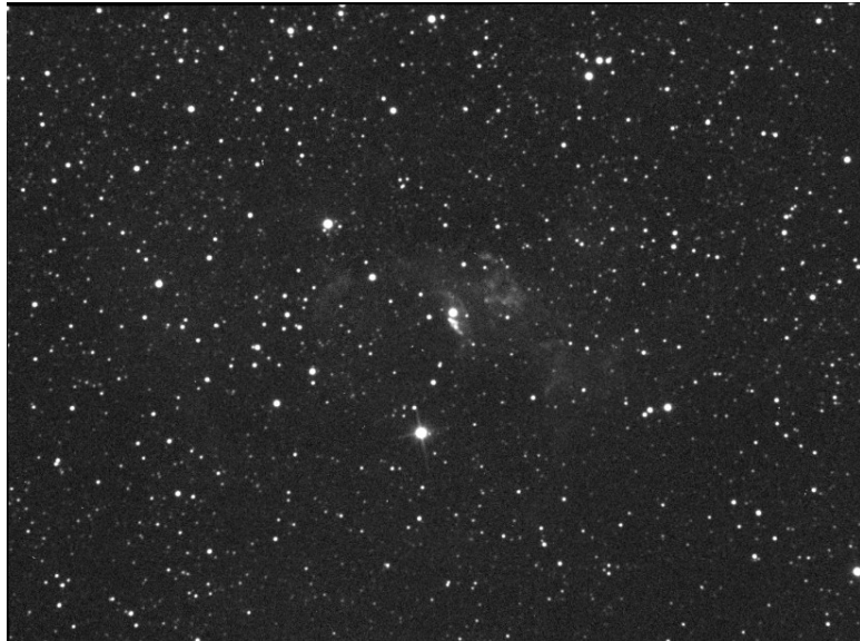
NGC 7635 - 06/12/2012 (filtro/filter SII)