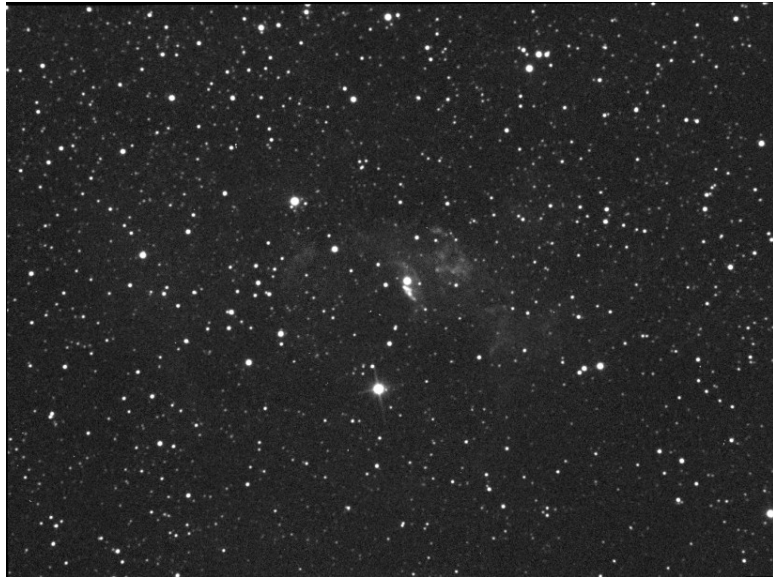
NGC 7635 - 06/12/2012 (filtro/filter SII)