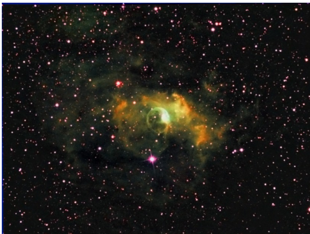
NGC 7635 - 06/12/2012

Note (note): LRGB (H \alpha SIIH \alpha OIII)