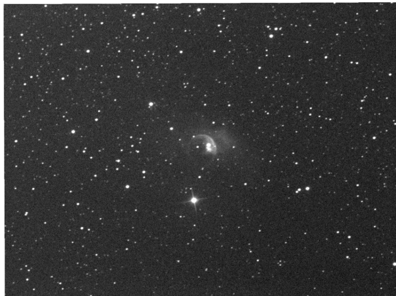
NGC 7635 - 06/12/2012 (filtro/filter OIII)